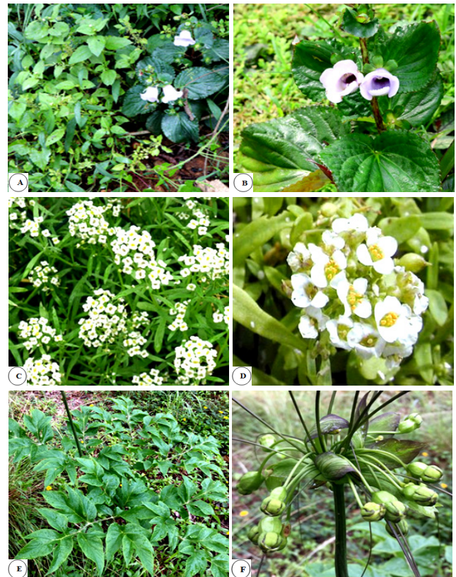
Plate 2: 2A: Gloxinia perrenis with its associated species; 2B: A single flowering twig of G. perrenis ; 2C: Flowering bunch of Lobularia maritima ; 2D: A single inflorescence of L. maritima ; 2E: Individual plant of Tacca leontopetaloides ; 2F: Fruiting branch and fruits of T. leontopetaloides .