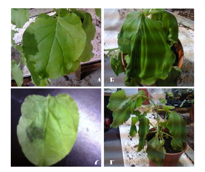
Figure 2: A-D Symptoms on bean ( Phaseolus vulgaris ) plants after mechanical inoculation with isolate of Tobacco mosaic virus (TMV). (A) Bean plant just after inoculation (B) Bean showing wilting after 3days of inoculation (C) Leaf showing necrotic lesion (D) wilted plant after one week of inoculation.

wilting was also associated with TMV. Our results also showed the infection of TMV on indicator plants in the form of local lesions and quick wilting.